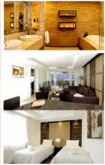
2-3 Bedroom Family Suites